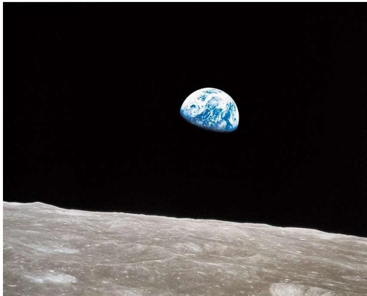
Figure 1: "Earthrise"

Ultimately, America's future, and indeed the world's, is irrevocably tied to the health of our ocean. Fifty years ago this past Christmas Eve, three American astronauts on the Apollo 8 mission became the first humans to orbit the moon. As they circled back around from the dark side, William Anders spotted our home planet seeming to "rise" above the moon's desolate gray surface. He scrambled for the mission camera, loaded a roll of color film, and snapped what has been called "the most influential environmental photograph ever taken."