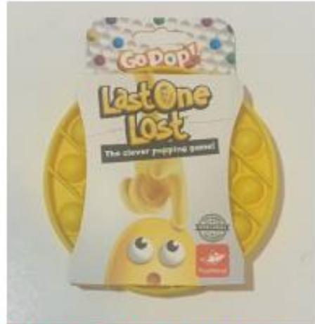
FoxMind's GoPop! has led to numerous knockoff toys.

The GoPop! toy's packaging has a label saying "WARNING: CHOKING HAZARD! Not suitable for children under 3 years." PIRG toy researchers found a listing called 2 Packs Pop Fidget Sensory Toys that does not include an age warning on the listing or the packaging. 37