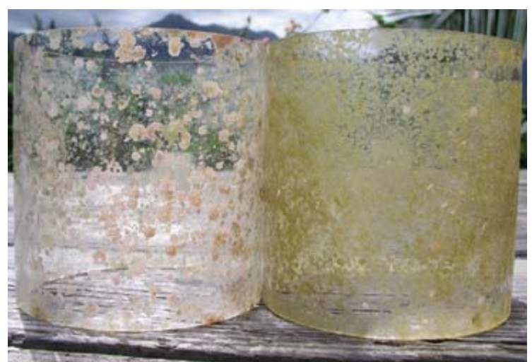
Figure 4. Encrusting algal communities on experimental cylinders. Control cylinder on the left was exposed to normal seawater at pH 8.17 and shows the pink crustose coralline algae colonies. On the right, this cylinder exposed to seawater at pH 7.91 shows growth of on non-calcifying algae.