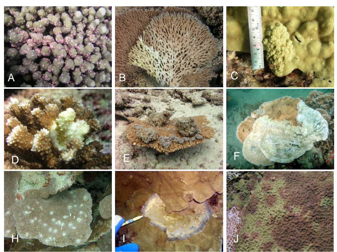
Figure 1. Some coral disease found in Hawai'i. A. Porites trematodiases. B. Acropora white syndrome. C. Porites growth anomalies. D. Pocillopora white band disease. E. Acropora growth anomalies. F. Montipora white syndrome. H. Montipora multi-focal tissue loss syndrome. I. Montipora dark band. J. Dark spot disease caused by endolithic hypermycosis.

bleached corals are more susceptible to disease (Bally and Garrabou, 2007). If this is true, Hawai'i should expect more disease outbreaks.