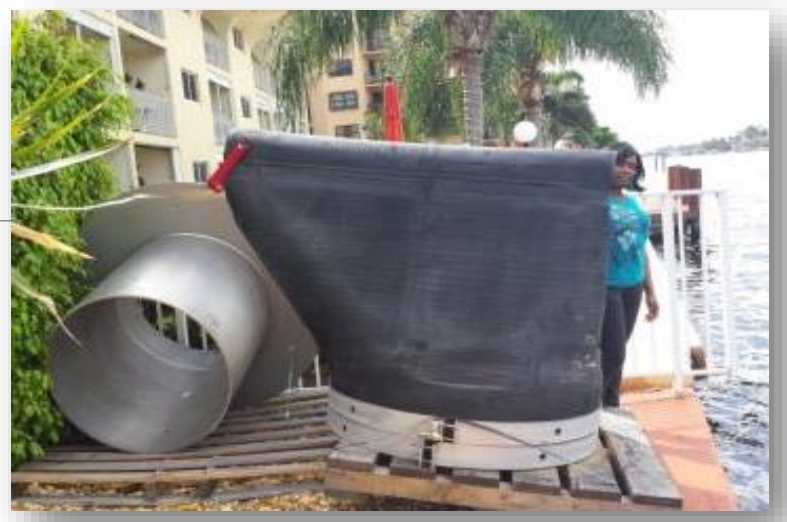
Stormwater valve - Pompano Beach, FL