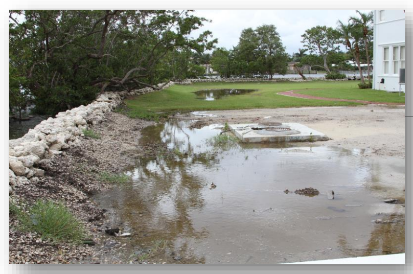
Residential berm – Hollywood, FL