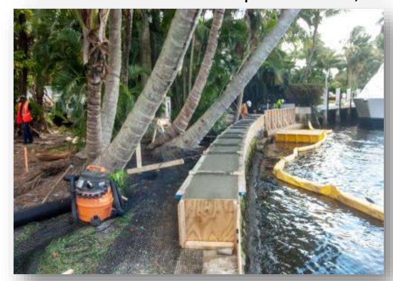
Elevated seawall – Fort Lauderdale, FL