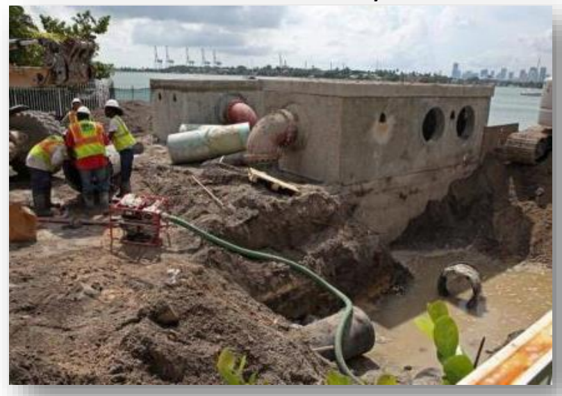
Stormwater pump – Miami Beach, FL