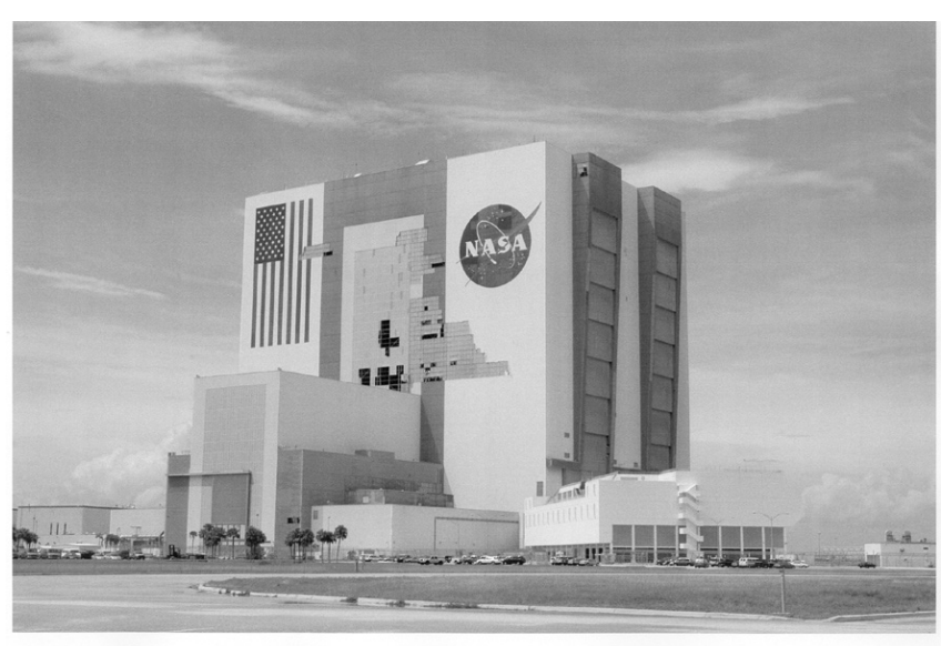
VAB—The massive Vehicle Assembly Building (VAB) at NASA Kennedy Space Center lost about 820 panels during Hurricane Frances. None of the equipment inside the building, was seriously damaged. The VAB is 525 feet tall and is covered by nearly 1,100,000 square feet of insulated aluminum panels and 70,000 square feet of plastic panels.