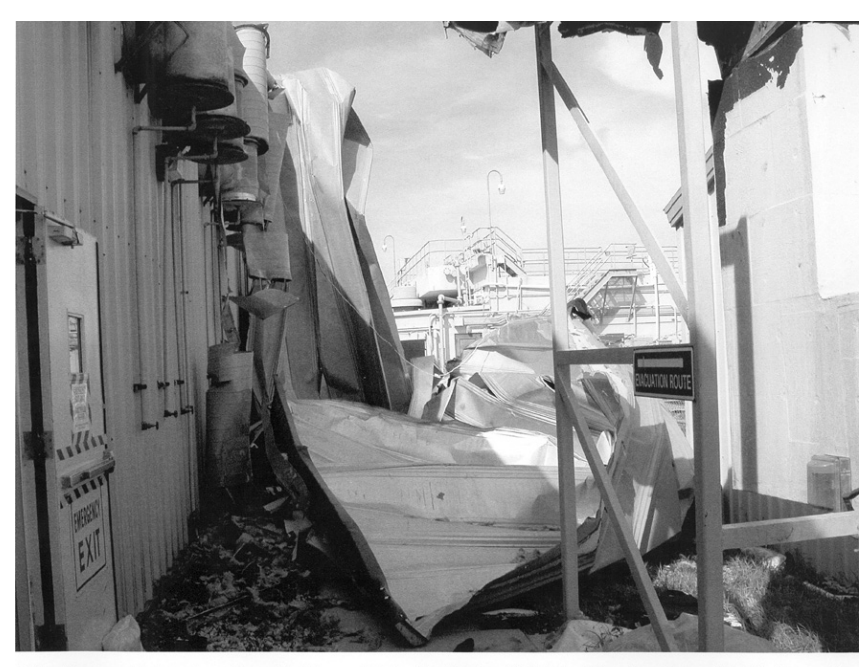
TPS—The mangled steel roof from the Thermal Protection System (TPS) Facility, where Space Shuttle tiles and blankets are manufactured, lies next to the structure. The interior of the facility is exposed to the elements. Initial assessments indicate that the work normally done at the TPS Facility may be accomplished at another location.