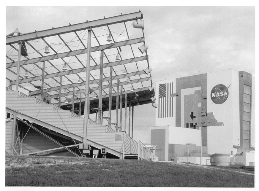
Grandstands—The roof protecting the viewing stands near the Kennedy Space Center press site was blown away during Hurricane Frances. In the background is the Vehicle Assembly Building, which also suffered significant exterior damage during the weekend storm.

Senator Brownback. Thank you very much, and I look forward to some of our discussion.