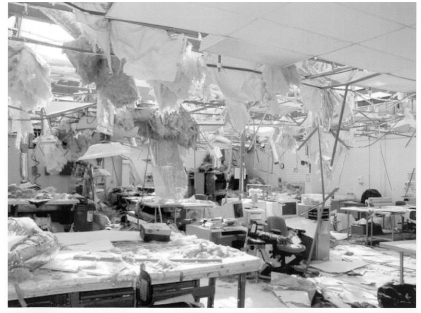
TPS Interior—The interior of the Thermal Protection System (TPS) Facility, where Space Shuttle tiles and blankets are manufactured, was exposed after a large section of the roof was torn away by Hurricane Frances over the Labor Day weekend. Work is under way to recover critical space flight material, such as tile molds, from exposed areas.