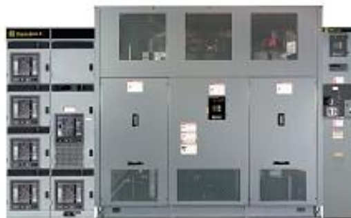
Figure 3 Distribution Transformer with Built-in Webserver

Vendor A was the first manufacturer in the world to embed an Ethernet interface and Web server into its power distribution equipment, allowing customers easier access to power system information. The family of power distribution equipment includes medium and low voltage switchgear, unit substations, motor control centers, switchboards and panelboards.