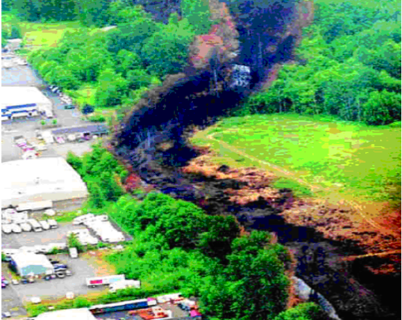
Figure 4 Bellingham, WA Gasoline Pipeline Rupture

Figure 4 shows the result of a Bellingham, WA, pipe rupture which an investigation concluded was not caused by an intentional act. Because of the detailed evaluation by NTSB, this is arguably the most documented ICS cyber incident. According to the NTSB Final Report, the SCADA system was the proximate cause of the event. Because of the availability of that information, a detailed post-event analysis was performed which provided a detailed time line, examination of the event, actions taken and actions that SHOULD HAVE been taken 6 .