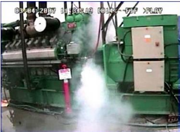
Figure 5 is a picture of the Idaho National Laboratory (INL) demonstration of the capability to intentionally destroy an electric generator from a cyber attack. 7