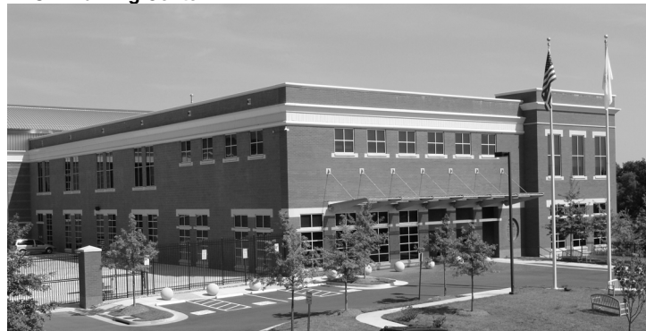
NTSB Training Center

NTSB has continued to increase the use of its Training Center—from 10 percent in fiscal year 2006 to 80 percent in fiscal year 2009. As a result, revenues have increased and the center's overall deficit has declined from about $3.9 million in fiscal year 2005 to about $1.9 million in fiscal year 2009.