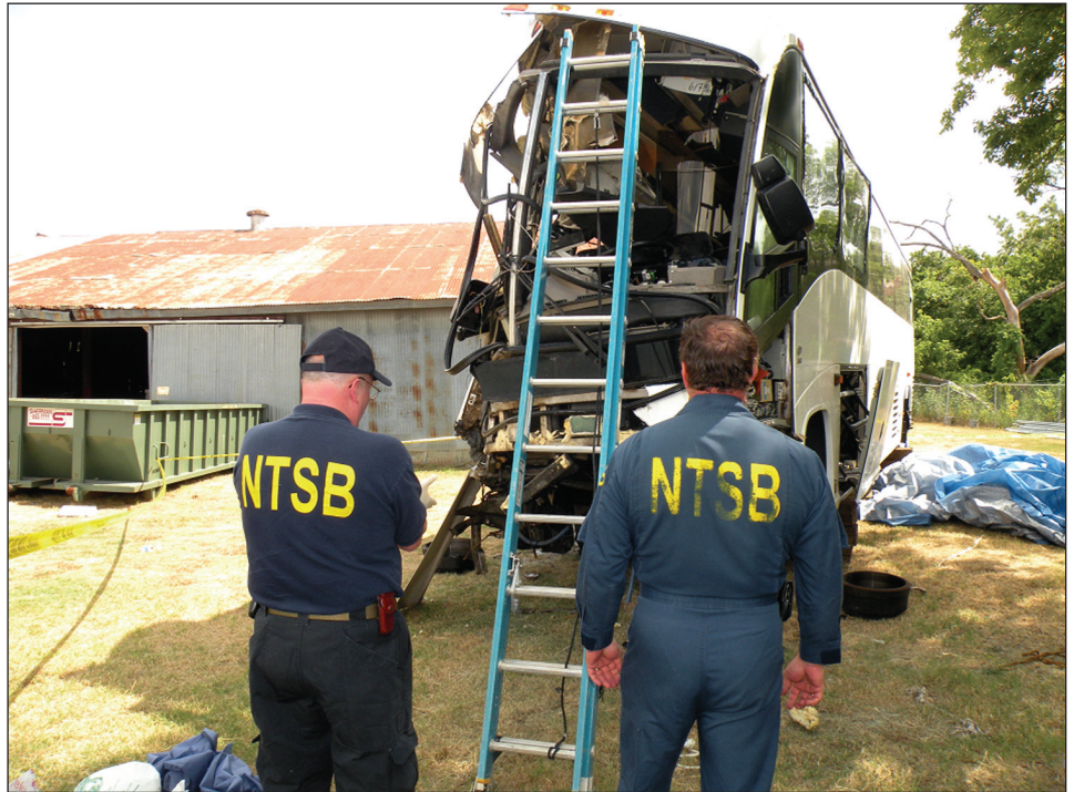
Figure 4: Two NTSB Investigators Assess Motorcoach Wreckage