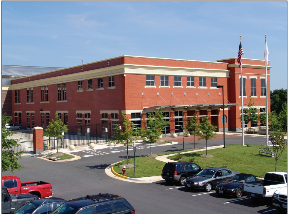
Figure 6: NTSB Training Center