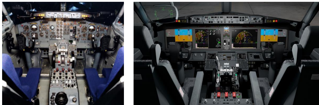
Figure 1. Evolution of Boeing 737 Flight Decks

Advances in aircraft automation have significantly contributed to safety and changed the way airline pilots perform their duties. Rather than manually flying an aircraft, pilots now monitor flight deck systems. Generally, new automation technologies are added to gain operational or efficiency advantages, such as reducing pilot workload, adding more capability, increasing fuel economy, and allowing access to airports surrounded by challenging terrain. FAA has estimated that automation is used 90 percent of the time in flight. 2 Figure 1 below shows the advances in flight deck technology between the Boeing 737-200 (pictured left) and 737 MAX 8 aircraft (pictured right).