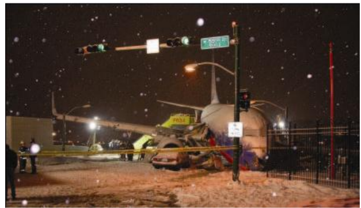
Figure 4. Southwest Airlines Flight 1248, Runway excursion and collision during landing at Chicago, Midway International Airport, December 8, 2005.

The NTSB has over 20 open safety recommendations to the FAA addressing airport surface safety, including 6 that we have classified as "Open-Unacceptable Response." These recommendations are as recent as September 2012 as well as dating back to 2000 and address a myriad of subjects that include ground safety movement systems for flight crews, wing tip clearance safety systems, enhanced wind dissemination information to flight crews, and prelanding distance assessments.