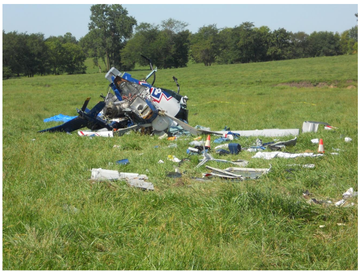
Figure 6. HEMS accident in Mosby, MO, August 26, 2011.

onboard to complete the mission before departing on the mission's first leg, his improper decision to continue the mission and make a second departure after he became aware of a critically low fuel level, and his failure to successfully enter an autorotation when the engine lost power due to fuel exhaustion. Contributing to the accident were (1) the pilot's distracted attention due to personal texting during safety-critical ground and flight operations, (2) his degraded performance due to fatigue, (3) the operator's lack of a policy requiring that an operational control center specialist be notified of abnormal fuel situations, and (4) the lack of practice representative of an actual engine failure at cruise airspeed in the pilot's autorotation training in the accident make and model helicopter.