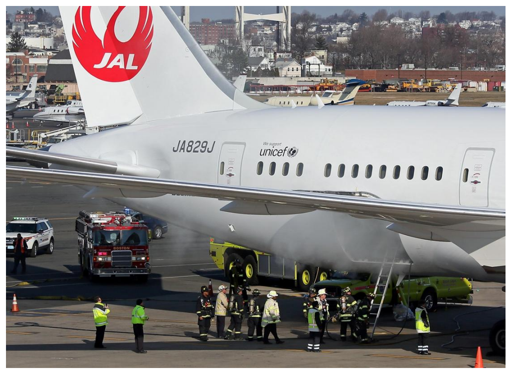
Figure 1. Smoke emanating from the aft electronic equipment bay.

As indicated above, fire safety was placed on the NTSB's Most Wanted List of transportation safety improvements in November 2012. For that reason, among others, the NTSB responded to the JAL event by sending investigators to evaluate the aircraft in Boston. About a week later, a similar event occurred while an All Nippon Airways 787 was in flight over Japan. The NTSB is investigating the JAL event and the Japan Transport Safety Board (JTSB) is investigating the ANA event, however both agencies are cooperating and sharing investigative information.