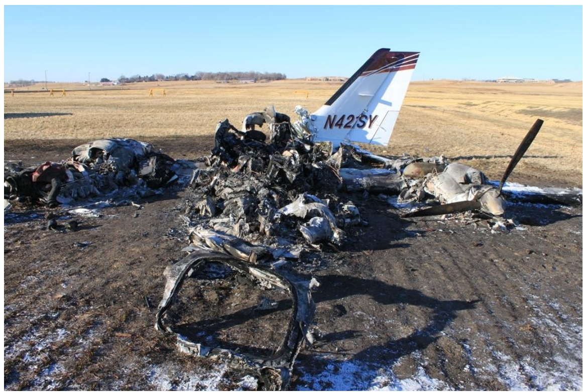
Figure 5. Sioux Falls, SD general aviation accident, December 9, 2011.

The leading causes of GA accidents are loss of control, engine failure, flying in conditions that are beyond the pilot or aircraft's abilities, and collision with terrain. GA is essentially an airline or maintenance operation of one, which means the entire aviation community must work harder to reach each pilot or mechanic who populates this community to address these issues and ensure this deadly cycle is broken. GA Safety is on the NTSB's Most Wanted List for the second year in a row in order to bring attention to the issue.