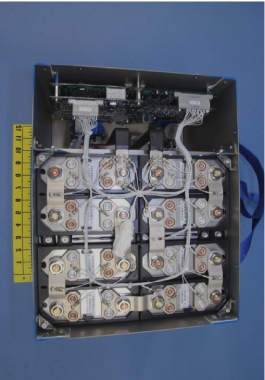
Figure 2. 787 Exemplar battery.

In the JAL event, each of the 8 cells experienced some thermal damage, and investigators believe there were multiple short circuits in battery cell 6 that started a thermal runaway that progressed throughout the battery. The side of the battery where cell 6 is located had the most extensive damage. All 8 cells have vent discs, which rupture when the internal pressure in a cell increases to a predetermined level. Seven of the eight discs ruptured, and the cell with the unopened vent disc lost electrolyte liquid.