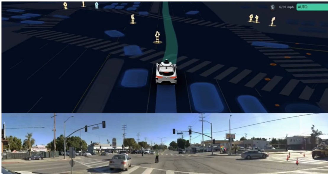
A Waymo vehicle recognizes and adheres to a police officer directing traffic at a Los Angeles intersection. 30