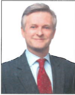
Steven Gill Bradbury