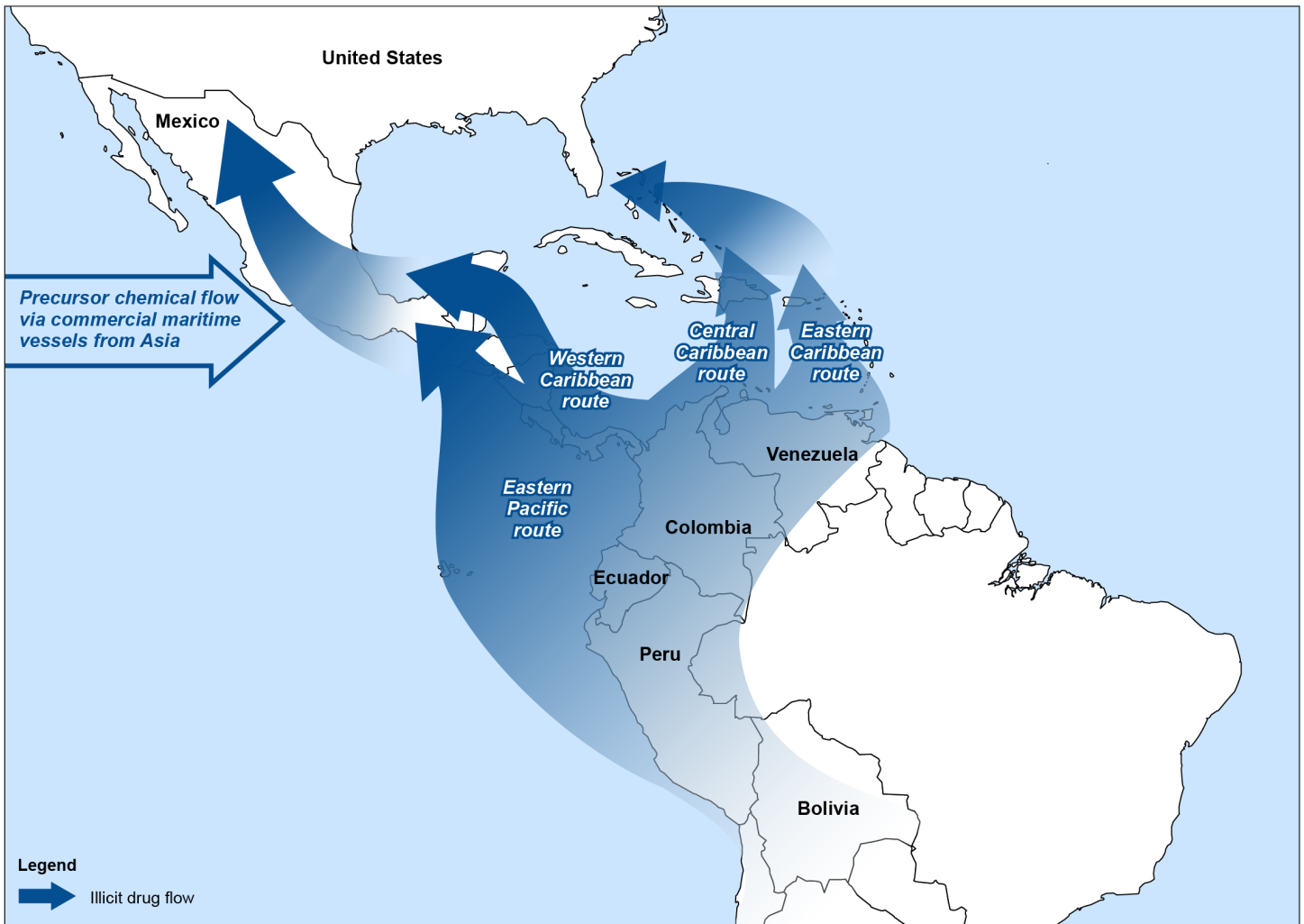
Figure 2: Maritime and Land Routes for Precursor Chemical and Illicit Drug Smuggling

Source: U.S. Coast Guard based on the Consolidated Counterdrug Database; Map Resources (Map). | GAO-24-107785