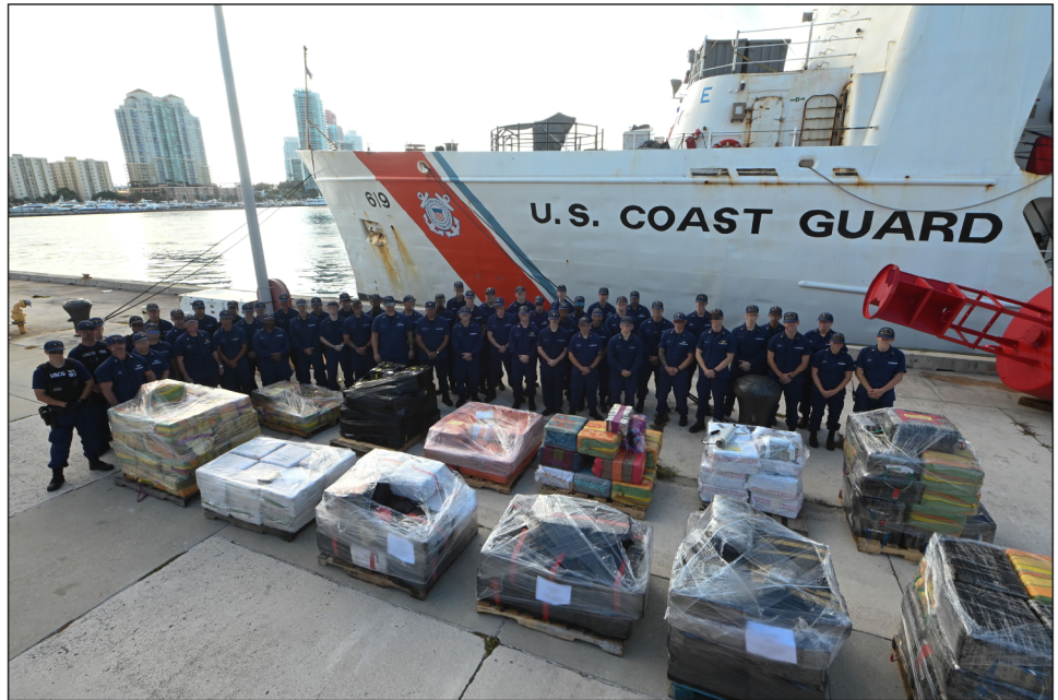
Figure 3: Joint Interagency Task Force-South Cocaine Seizure in the Caribbean Sea, September 2023

Source: U.S. Coast Guard photo by Petty Officer 3rd Class Santiago Gomez. | GAO-24-107785