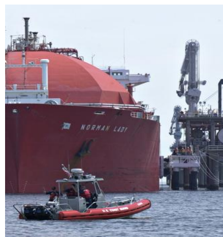
LNG Tanker security zone enforced by Coast Guard small boat.

As we pursue strategies, tactics and authorities to secure our borders from entry of dangerous materials and people, we must also consider the security of legitimate commerce in the maritime domain. This is particularly important when considering the health and safety risks vessels carrying Certain Dangerous Cargoes (CDCs) such as Liquefied Natural Gas (LNG), chlorine, anhydrous ammonia and various petroleum products present in our ports, waterways and adjacent population centers. The expansion of LNG facilities and corresponding increase in waterborne LNG shipments to meet our nation's energy demands is well known. However, LNG is just one of many CDCs transported through the MTS that must be considered in a national dialogue on cargo and energy infrastructure security.