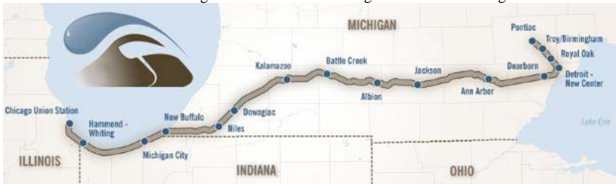
Exhibit D: Chicago-Detroit/Pontiac Passenger Rail Corridor Program

Exhibit E portrays the ownership of rail along the Chicago-Detroit/Pontiac corridor. Since 1995, FRA, Amtrak and MDOT have tested, developed and implemented Incremental Train Control System (ITCS), which is a communications-based Positive Train Control (PTC) system to allow trains to travel at speeds more than 90 mph, between Porter, Indiana, and Kalamazoo, Michigan. Trains have been traveling at 110mph on this segment since February 2012. This was the first place not connected to the Northeast Corridor to operate at 110 mph.