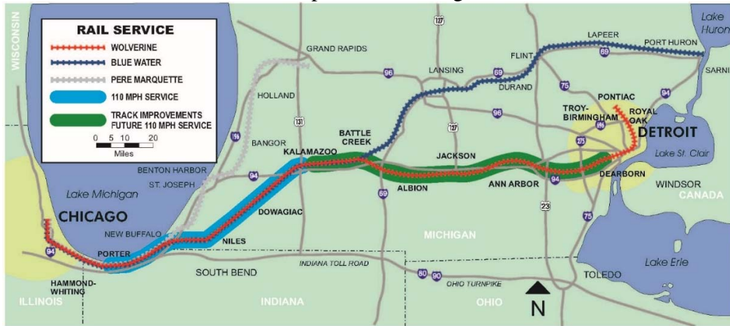
Exhibit E: Ownership of Rail, Chicago-Detroit/Pontiac

MDOT has contracted with Amtrak for intercity passenger rail service since 1973. Michigan has continued (Chicago-Detroit/Pontiac) this relationship over the years, even as the financial burden to the state has greatly increased. There are three Amtrak-operated services in Michigan: the Pere Marquette service (Grand Rapids – Chicago), the Blue Water service (Port Huron – Chicago), and the Wolverine service (Pontiac – Detroit – Chicago). These services are summarized below: