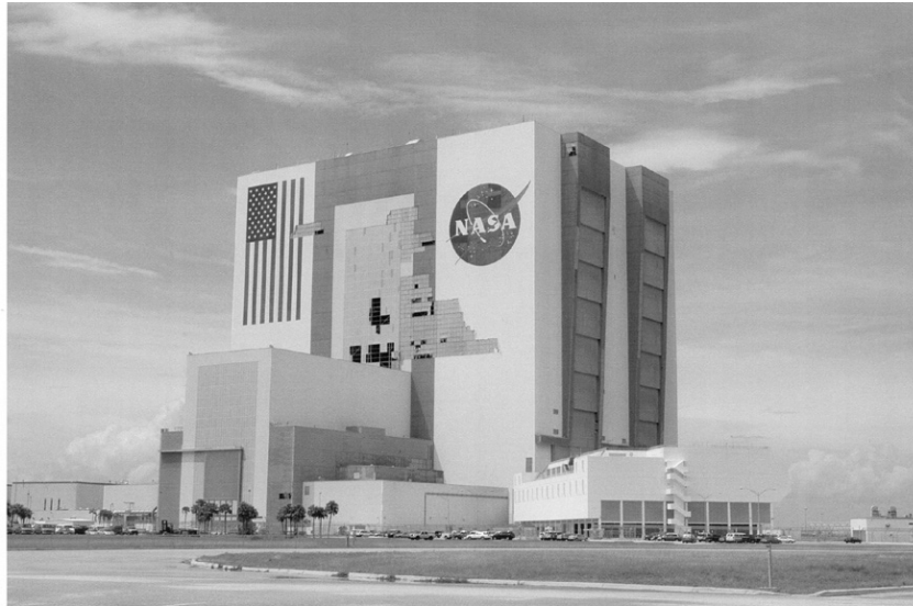
VAB—The massive Vehicle Assembly Building (VAB) at NASA Kennedy Space Center lost about 820 panels during Hurricane Frances. None of the equipment inside the building, was seriously damaged. The VAB is 525 feet tall and is covered by nearly 1,100,000 square feet of insulated aluminum panels and 70,000 square feet of plastic panels.