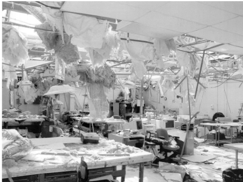
TPS Interior —The interior of the Thermal Protection System (TPS) Facility, where Space Shuttle tiles and blankets are manufactured, was exposed after a large section of the roof was torn away by Hurricane Frances over the Labor Day weekend. Work is under way to recover critical space flight material, such as tile molds, from exposed areas.