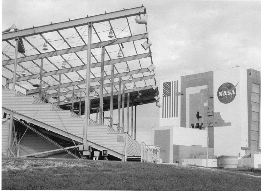
Grandstands—The roof protecting the viewing stands near the Kennedy Space Center press site was blown away during Hurricane Frances. In the background is the Vehicle Assembly Building, which also suffered significant exterior damage during the weekend storm.

Senator BROWNBACK. Thank you very much, and I look forward to some of our discussion.