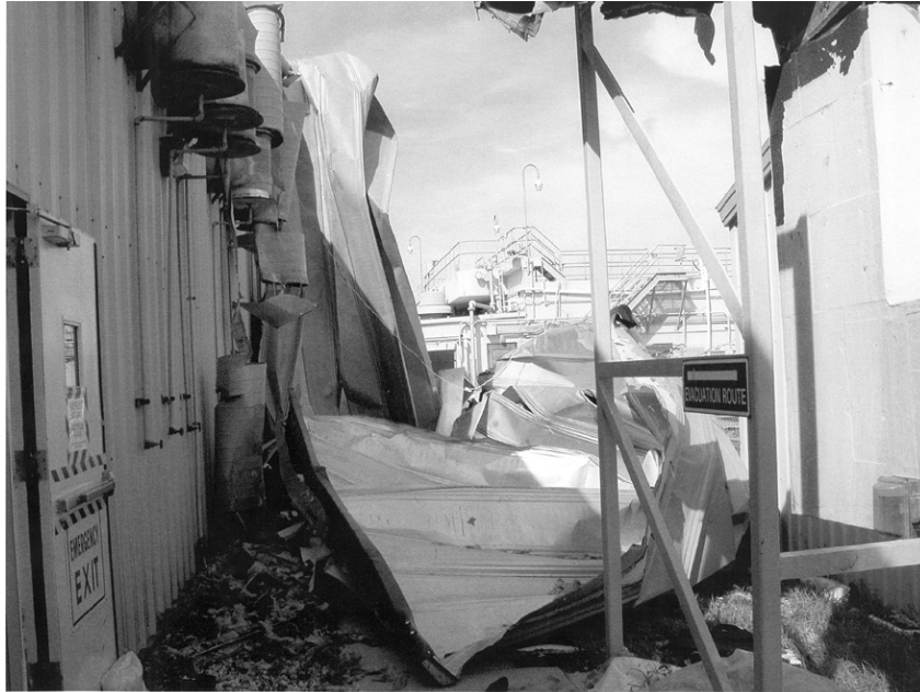
TPS —The mangled steel roof from the Thermal Protection System (TPS) Facility, where Space Shuttle tiles and blankets are manufactured, lies next to the structure. The interior of the facility is exposed to the elements. Initial assessments indicate that the work normally done at the TPS Facility may be accomplished at another location.