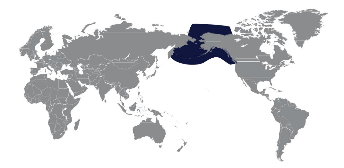
Figure 1 : NPRB supports research in the marine systems of the North Pacific, including the Gulf of Alaska (Strait of Juan de Fuca to Unimak Pass), Bering Sea (Alaska Peninsula to the Kamchatka Peninsula and north to the Bering Strait), Aleutian Islands (Unimak Pass to the Commander Islands), Chukchi Sea (Point Barrow to Cape Billings), Beaufort Sea (Point Barrow to Victoria Island), and processes in the North Pacific and Arctic Ocean basins relevant to these regions.

NPRB supports three marine science research programs, as well as graduate student research awards: