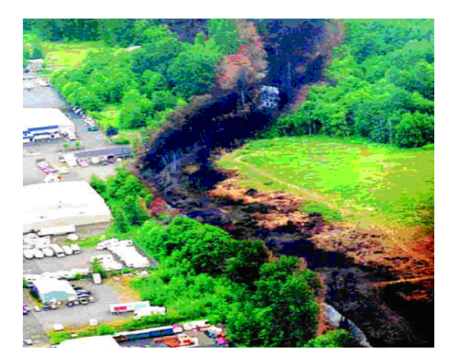
Figure 4 Bellingham, WA Gasoline Pipeline Rupture

Figure 4 shows the result of a Bellingham, WA, pipe rupture which an investigation concluded was not caused by an intentional act. Because of the detailed evaluation by NTSB, this is arguably the most documented ICS cyber incident. According to the NTSB Final Report, the SCADA system was the proximate cause of the event. Because of the availability of that information, a detailed post-event analysis was performed which provided a detailed time line, examination of the event, actions taken and actions that SHOULD HAVE been taken<sup>6</sup>.