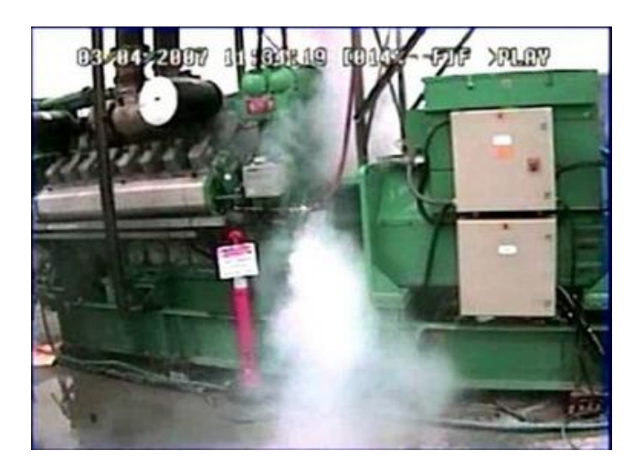
Figure 5 is a picture of the Idaho National Laboratory (INL) demonstration of the capability to intentionally destroy an electric generator from a cyber attack.<sup>7</sup>