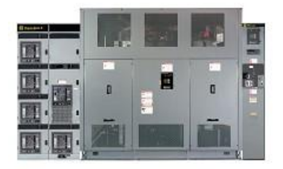
Figure 3 Distribution Transformer with Built-in Webserver

Vendor A was the first manufacturer in the world to embed an Ethernet interface and Web server into its power distribution equipment, allowing customers easier access to power system information. The family of power distribution equipment includes medium and low voltage switchgear, unit substations, motor control centers, switchboards and panelboards.